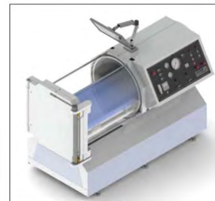
Half Acrylic (HA) O 2 mono

The chamber has a cylindrical shape and one entrance door.