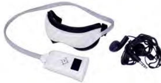
Eye massager goggles