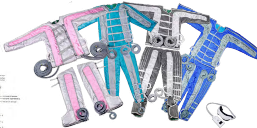
Alternative colours available