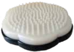
Circle-dots Massage Head