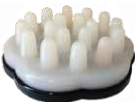
Columnar Massage Head