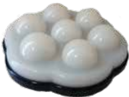
Half-sphere Massage Head