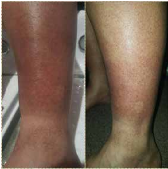
Poor Blood Circulation

In just 7 Sessions the blood circulation was improved through Ozone-Technology