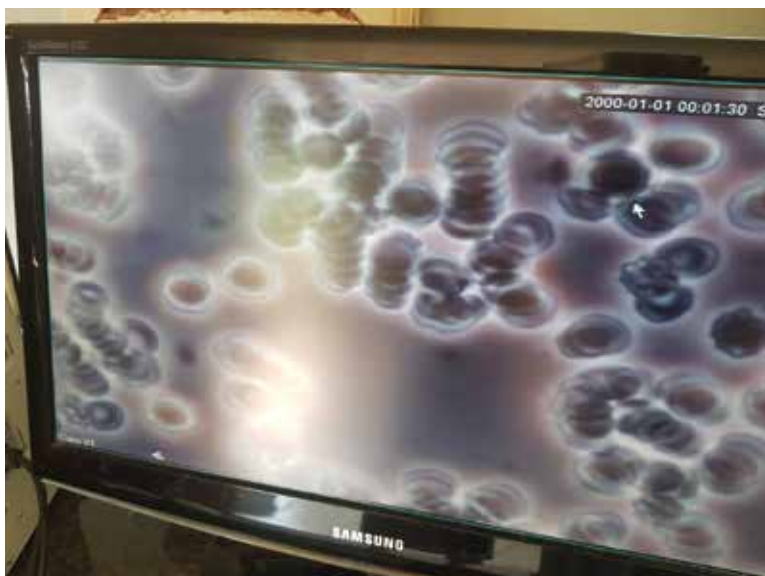
Blood sample Before a HOCATT™ Session