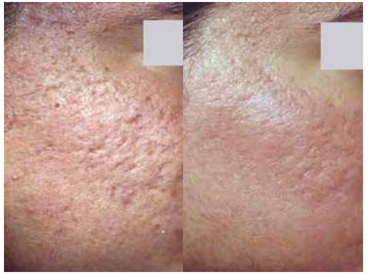
Acne: Before & After

In just 7 Sessions the blood circulation was improved through Ozone-Technology