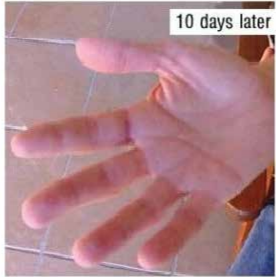
10 days later