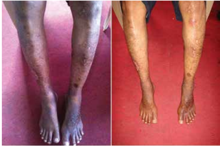
Before Ozone bagging